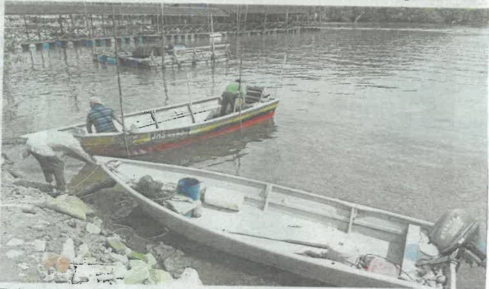
The livelihood of coastal fishermen in Gelang Patah has been badly affected by large-scale land reclamation activities.

State urged to gazette coastal areas as fishing zones